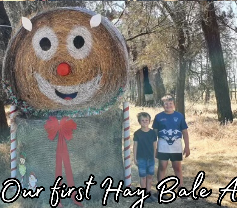
Our first Hay Bale Art!