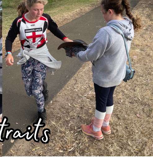
Year 5/6 Self-Portraits