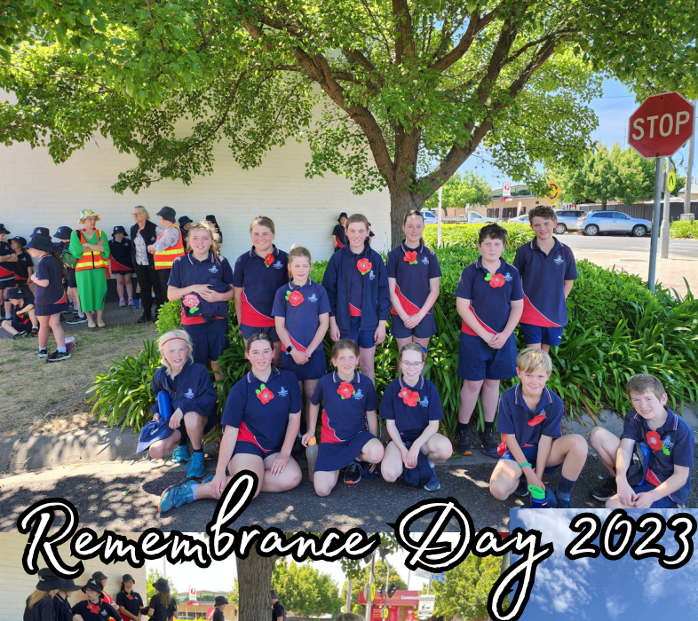
Remembrance Day 2023