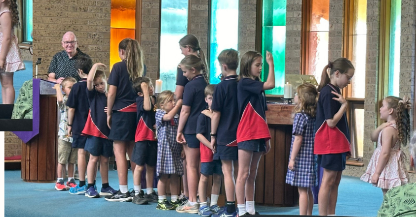
Opening School Mass

Don't forget Mum's cuppa on Monday, 26th @ 8.30 a.m.