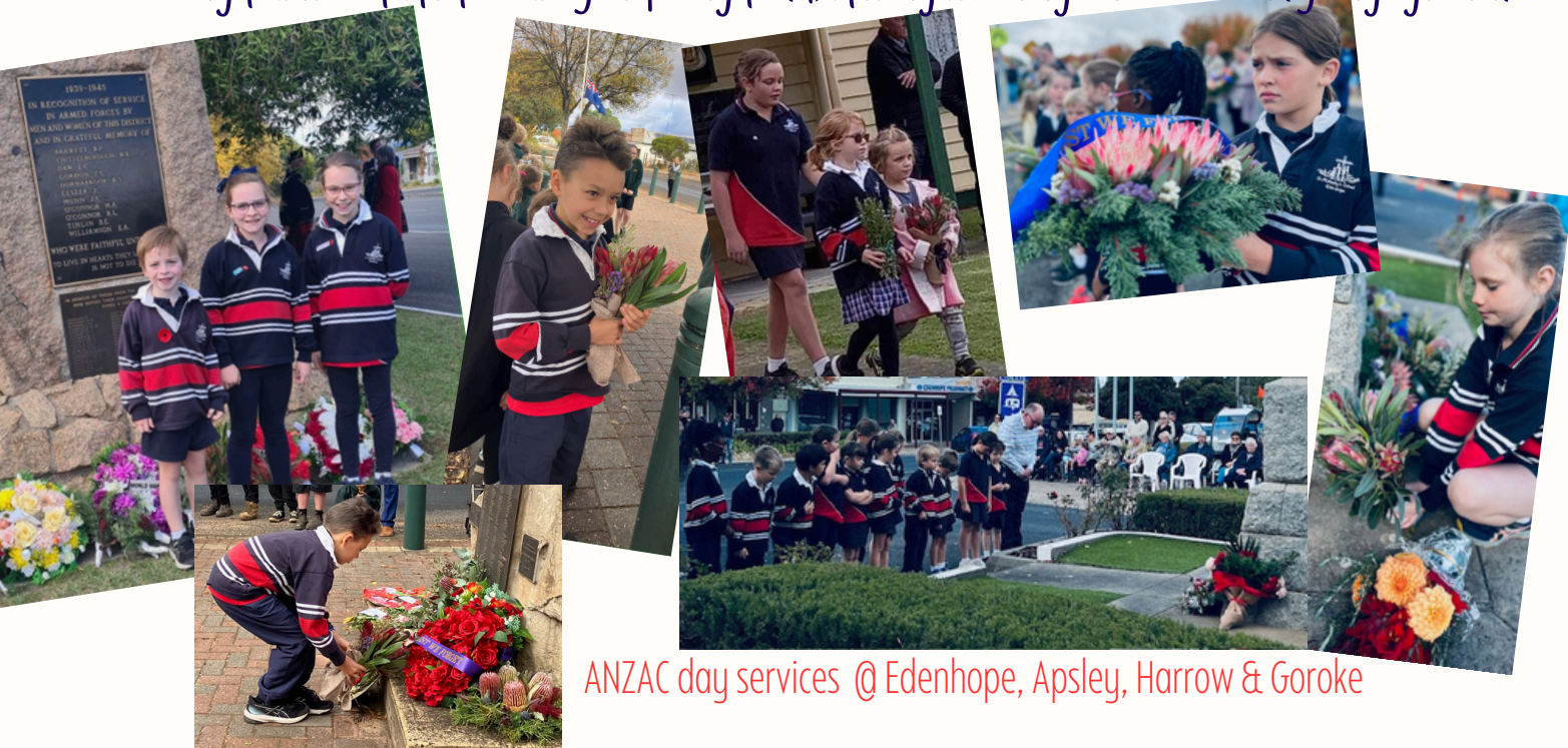
ANZAC day services @ Edenhope, Apsley, Harrow & Goroke

"Pursuing fullness of life for all by inspiring faith, lifelong learning and community engagement."